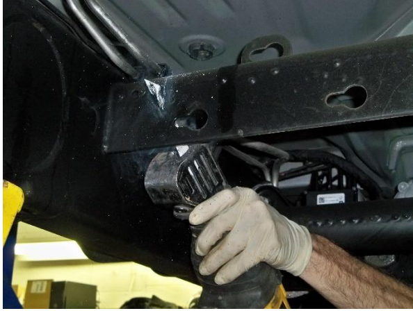
(Fig. 9) Cut jig bracket with saw or grinder.