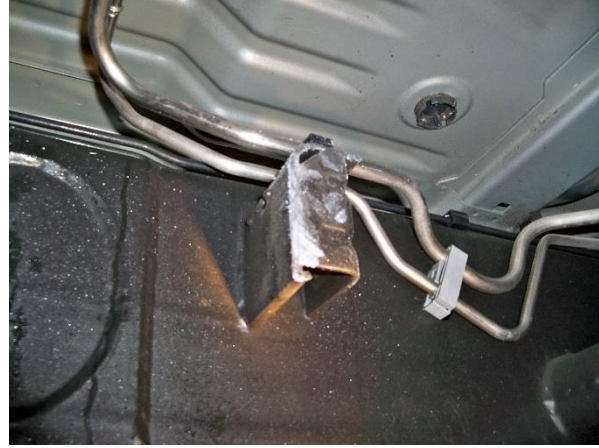
(Fig. 10) Jig bracket shown cut away leaving weldment holding fuel lines.