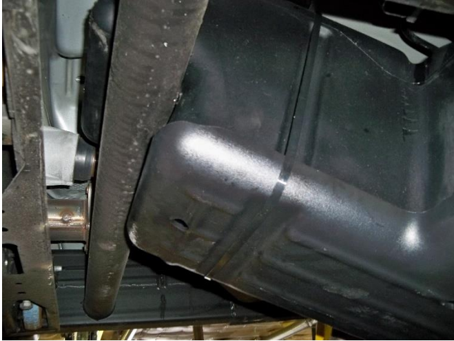
(Fig. 11) Angle front of tank up and over round tubular steel cross member.