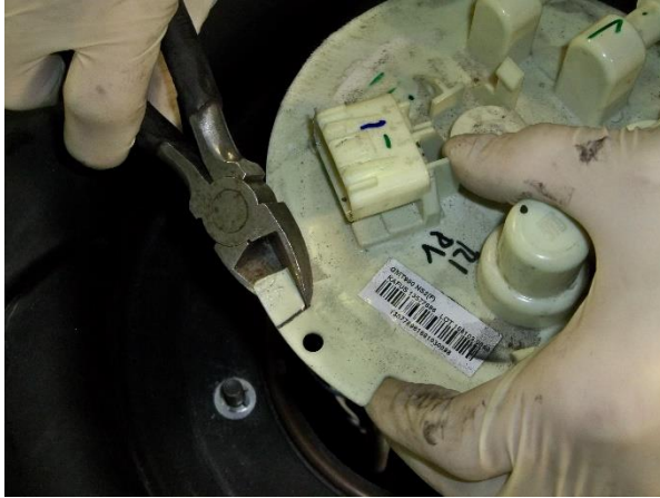
(Fig. 5) If sending unit connections interfere with the mounting studs, trim ½" off the side of the tab nearest the electrical connector.