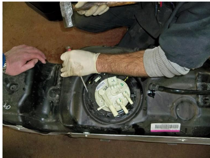
(Fig. 2) Loosen hold-down ring on OEM tank by tapping counter-clockwise, remove and lift out sending unit.