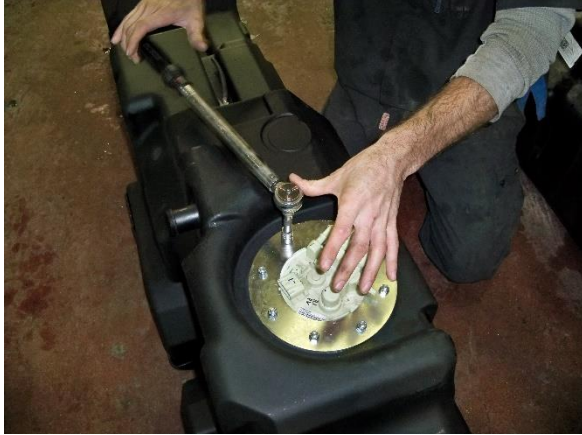
(Fig. 7) Using a torque wrench, tighten the top Flange nuts to 20 ft. lbs. using a "star" pattern.