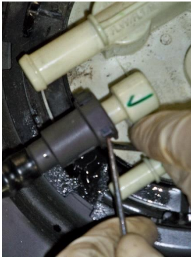
(Fig. 1) Disconnect fuel lines at the sending unit using pick.