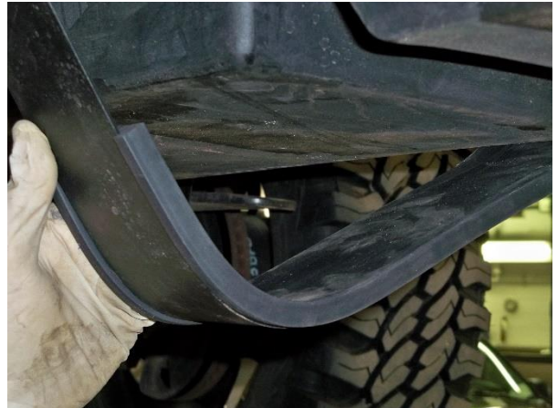
(Fig.13) Extruded bushings installed on straps.

28 Make sure ALL mounting hardware, clamps, bolts, etc. are properly installed and TIGHT. Double check it.