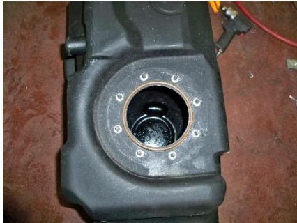
(Fig. 3) Leave the "O" ring gasket, studs and retainers assembled as they are (shown before sending unit, top flange, and 3/8" nylon Locking nuts are installed).

it can be corrected by either shaving approximately 1/16" off the outside of the ribs, or by entirely removing the rib closest to the electrical plug with a pair of dikes (diagonal cutters) and hand grinder-sander (See Fig. 4).