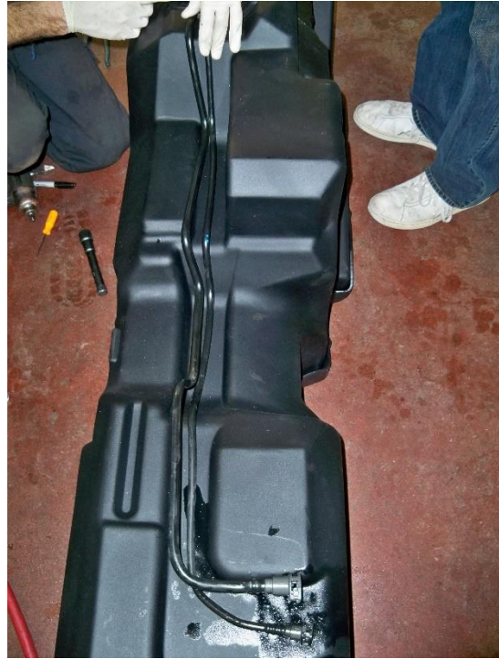
(Fig. 8) Attach the fuel lines to the sending unit and lay them in the retaining groove provided on the top of the replacement tank.