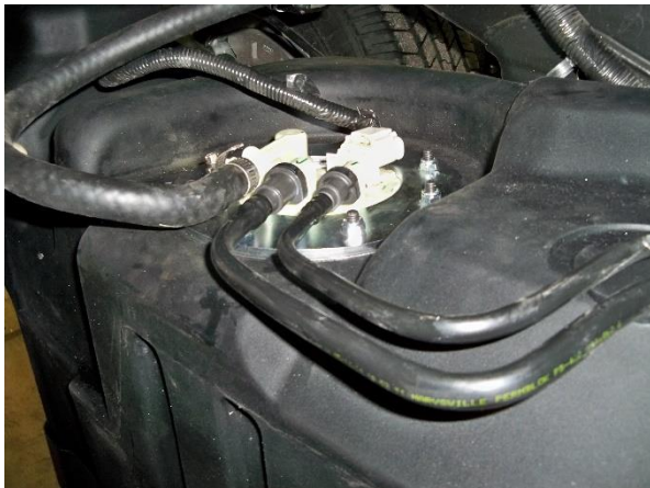
(Fig. 12) Lift tank high enough to reconnect electrical cable and vent hose to sending unit.