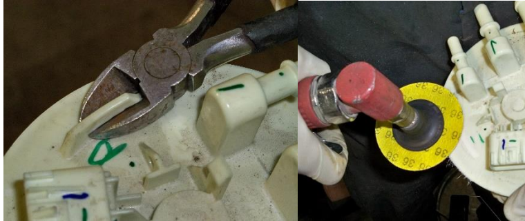
(Fig. 4) If sending unit is equipped with curved ribs on the top, either shave approximately 1/16" off the outside surface of both, or remove the rib closest to the electrical plug using dikes and a hand grinder-sander as shown above so top flange will fit correctly. Be sure surface is perfectly smooth and even to prevent breakage when top flange is tightened.