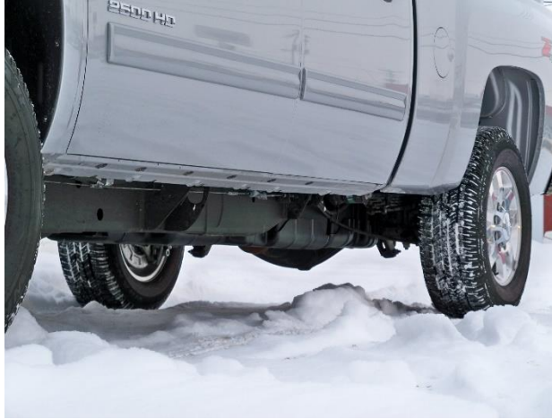
(Fig. 14) Installation Complete!